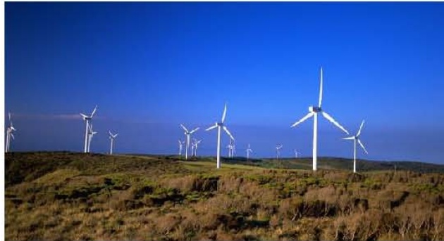
Photo of Woolnorth Wind Farm

Are you are thinking about choices for tertiary study?