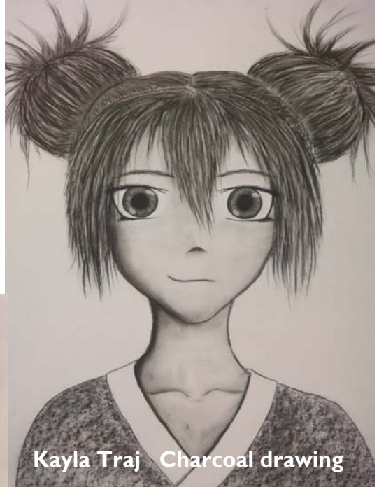
Kayla Traj Charcoal drawing