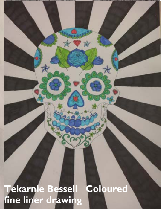
Tekarnie Bessell Coloured fine liner drawing